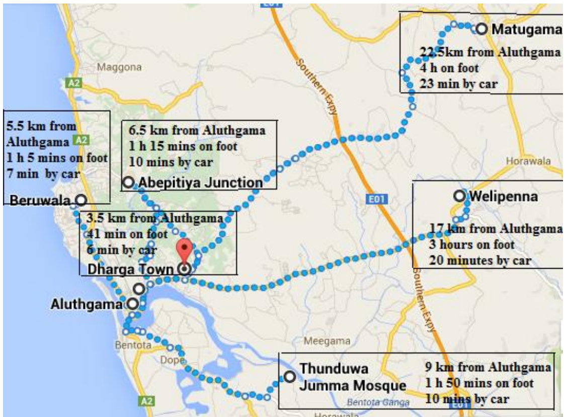
Map II: Affected areas in Dharga Town