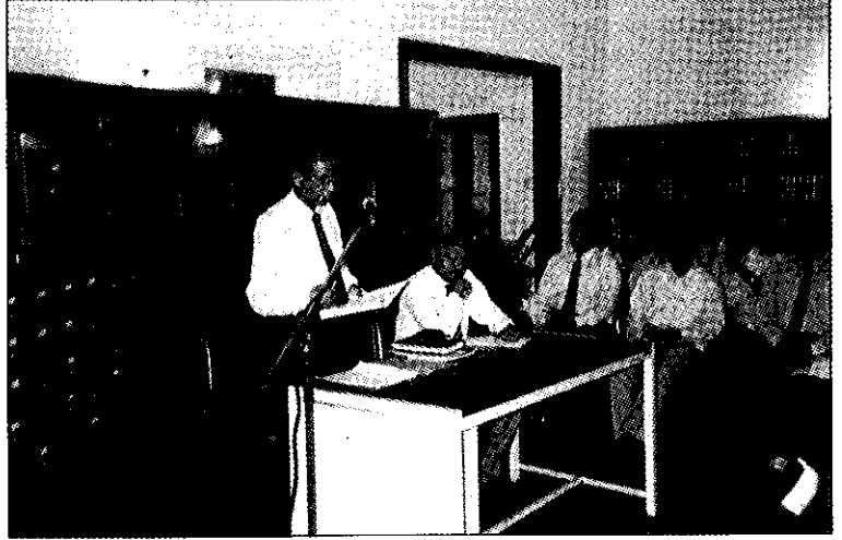
Public lecture: "New Incentives for Foreign Investment in Sri Lanka"