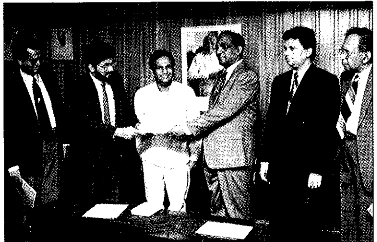
Presentation of report on "Consumer Protection and Fair Trading in Sri Lanka" to Hon. A.R. Munsoor Minister of Trade & Commerce.