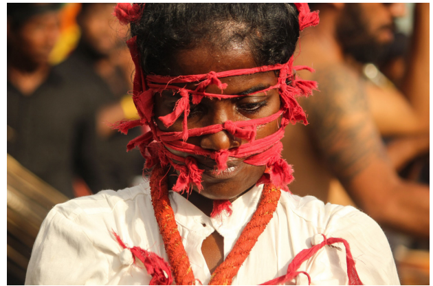
Photograph 23: A young artist at the Aragalaya depicting suppression experienced under the Rajapaksa Regime (Gamage, The Suppression of Satakaya 2022)

Wedewardena about corrupt politicians in Sri Lanka (Upamali 2022).