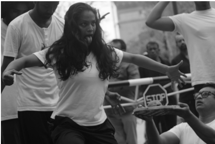
Photograph 19: The artists enact a street drama to capture the economic pressure faced by people. (Gamage, The Hungry Ghost 2022)

The People's Struggle in Sri Lanka in 2022 (Argalaya) was a kaleidoscope of Sri Lankan art and culture and it provided space for much-needed political expression and education. The slogans on the placards have different expressions. They use different symbols and make different demands stressing the ultimate goal of the people – see to the resignation of the president as #Gotagohome.