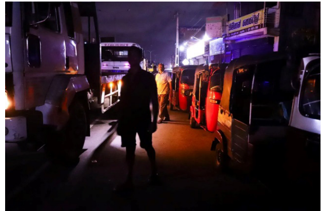
Photograph 05: Drivers queue overnight to buy fuel as Sri Lanka's economic crisis worsens. (Gamage, Petrol queue in Kelaniya 2022).