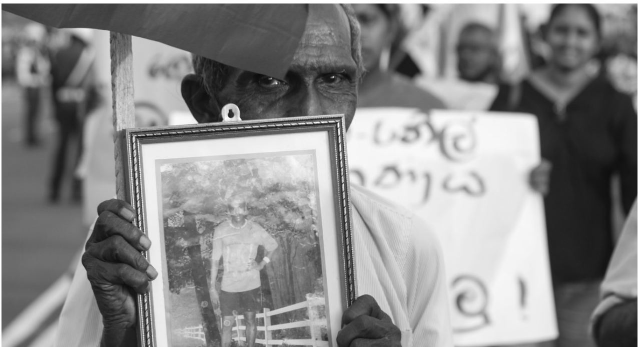
Photograph 16: A Father holding a photograph of his son who disappeared during the war. Taken on the 50 th day of protest march at Galle Face Green (Gamage, A Father's Grief 2022)

The Peoples Protest Movement 2022 (Aragalaya/Poraattam) was a result of the increased economic pressures on the people. Initially, the Aragalaya origins were traced to ad-hoc pocket protests and resistance which mushroomed in Colombo and it's environ. A significant feature of the People's Protest Movement (Aragalaya) is that it was decentralized, and it was decentralized by default. Diverse interest groups and stakeholders contributed to the Aragalaya providing ideological, financial and political support. It turned into an "Occupy" movement after the 9 th of April 2022, crystalizing as Gotagogama in Galle Face Green. It became the arena for people to come to and express their frustration with the economic chaos as well as their grievances relating to long-term social, political, and economic issues, including Sri Lanka's entrenched authoritarian politics. It opened-up the floodgates for other grievances including issues relating to war victims and disappearances, actions against media freedom, justice for victims of the Easter Sunday Bomb attack, the impoverishment of the farmers, environmental issues, and LGBTQ rights. All these issues became core components of this People's Protest Movement.