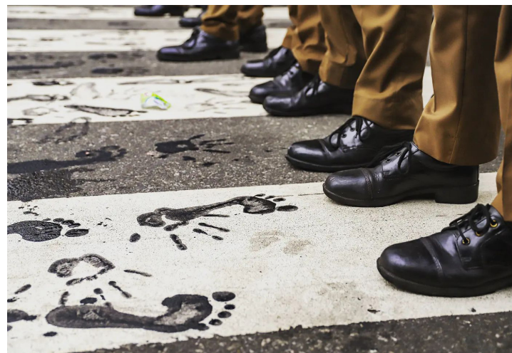
Photograph 10: Confrontation with military police at CID Head Quarters. An artistic protest against arbitrary arrests (Gamage, The Forms of Resistance 2022)