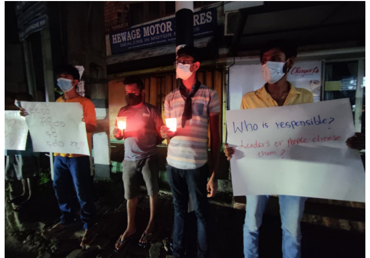
Photograph 07: As Sri Lanka's economic crisis worsens, the protesters held a candlelight vigil at Kohuwala Junction Colombo holding signboards with various slogans relating to their grievances. Suburbs.

The first visible protest against the economic crisis began in Kohuwala on the 1st of March 2022. The protesters held a candlelight vigil while holding signboards with various slogans related to their grievances. The major change in the format of the protests occurred when hundreds of Sri Lankans, weary of power cuts and shortages of all essentials converged near President Gotabaya Rajapaksa's private residence in Mirihana on 31st of March 2022, demanding that the President find solutions to the many issues in the country or 'go home' (Colombo Page, 2022). The Mirihana protest was violently suppressed by the Sri Lankan Security forces, causing injuries to approximately 50 people and these included journalists, civilians as well as members of the security forces (News1st, 2022). This incident resulted in galvanizing the protest movement and it drew large crowds from different classes of Sri Lankan society despite the government's efforts to contain it by imposing a curfew and other suppressive methods.