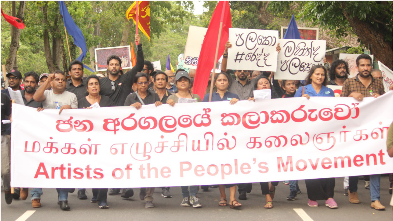
Photograph 17: The protest March by The Artists of People's Movement in April 2022 (Gamage, Jana Aragalaye Kalakaruwo 2022)

From the beginning of the movement artists' collectives played a prominent role in expressing people's frustrations and mobilizing people on various causes, through the initiative of "Jana Aragalaye Kalakaruwo collective" (Artists of the People's Struggle).