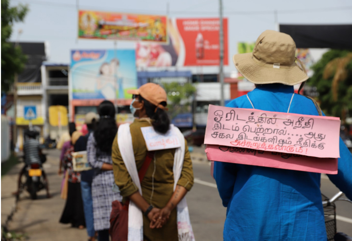
Photograph 18: Batticaloa Justice Walk July 2022 (Gamage, Justice Walk 2022)

The People's Struggle in Sri Lanka in 2022 (Argalaya) was a kaleidoscope of Sri Lankan art and culture and it provided space for much-needed political expression and education. The slogans on the placards have different expressions. They use different symbols and make different demands stressing the ultimate goal of the people – see to the resignation of the president as #Gotagohome.