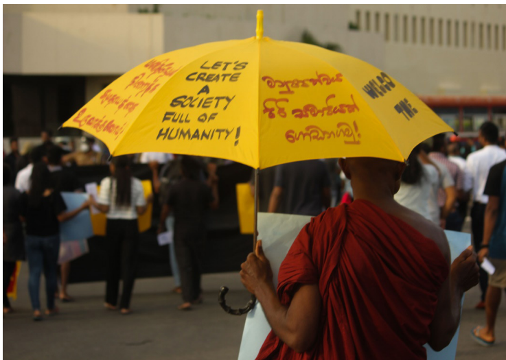
Photograph 12: Buddhist monk using his umbrella to project a message (Gamage, Monk Protester 2022)

to step back, reflect and to see, hear and sense political conflict and dilemmas in new ways. A key part of this aesthetic sensibility is to widen our understanding of the political beyond prevailing rationalist models and to recognize the key role played by emotions in politics. Indeed, few realms are more infused with emotion than politics (Bleiker 2018). Emotions play a key role in politics and in society. It reshapes the way people are responding and reacting to political actions. For instance, during the Mirihana protest the photograph of “The Mother and Child” became the icon of the people’s struggle in Sri Lanka. The relentless repression of the protesters by government forces as well as the broader situation in the country generated empathetic emotions to this image. Those perceptions spurred further mobilization of people against the government and established the people’s struggle as recognized protest movement since early April 2022 and in this context it legitimized the occupation of public spaces.