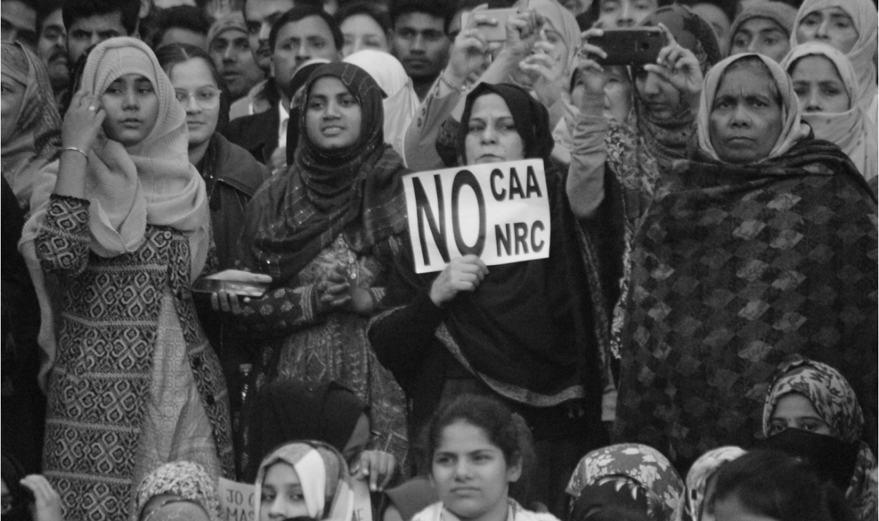
Photograph 14 Women at Jamia Millia Islamia University New Delhi, India protesting against the Citizenship Amendment Act, the National Register of Citizens and the National Population Register in India . (Gamage, Anti CCA Protesters at New Delhi India 2019)