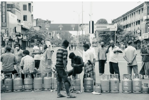
Photograph 03: Gas Cylinder Protest. Protestors frustrated by the lack of liquid gas at Amour's Street junction, Colombo 11, close the road. (Gamage, Cylinder Protest 2022)