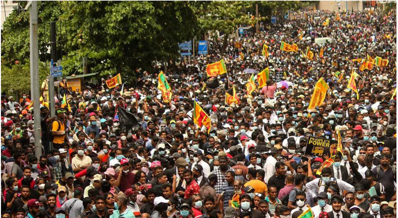
Photograph 30: Thousands of protesters gathered at Chatham Street Colombo for the Occupy the President's Palace protest. Taken before the ouster of former President Gotabaya on 9 th of July 2022 (Gamage, 9th of July 2022).

Art, as a medium, has the capacity for generating wider discourses and debates in society. Nothing in life is apolitical and every form of art too has a direct or indirect meaning in politics. The ruling class dominates the modern State through the exercise of its powers.