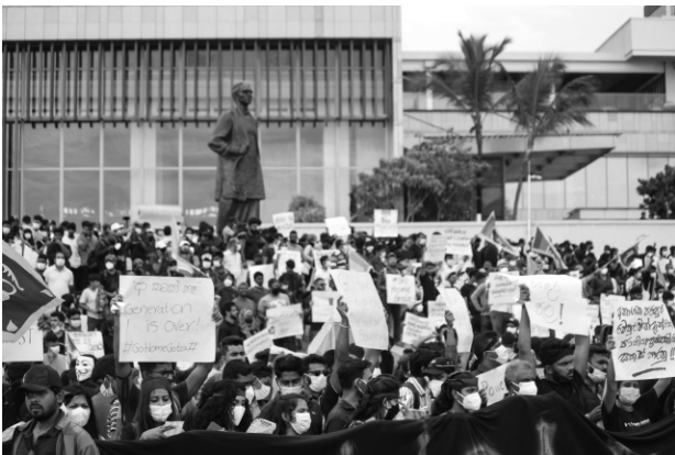
Photograph 2: Occupy Galle Face Protest Movement. First day of People's Struggle. (Gamage, Occupy Galle Face Movement 2022)