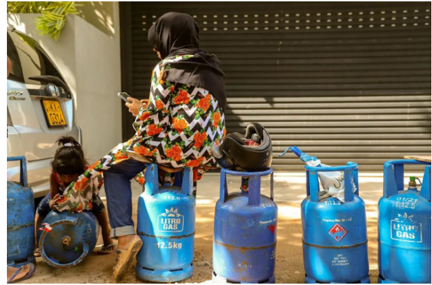
Photograph 04: Patient householders - A Little girl and her mother waiting patiently in the queue to buy liquefied petroleum gas (LPG), Kirulapona Junction. Shortages of gas cylinders amid shortages of other essentials, Sri Lankan capital Colombo (Gamage, Little Girl and Mother coping with the crisis 2022)

The people's struggle in Sri Lanka was manifested through a mass protest movement locally known as the Aragalaya (in Sinhala) and the Poraattam (in Tamil). It was the reaction to the unprecedented economic collapse and political chaos in the country. The sporadic and individual protests, with several pocket protests and people's movements that sprang up in various sites in the country gained momentum and converged as a fully-fledged people's resistance movement. These waves of mass protests and demonstrations throughout the country were accompanied by protests outside the country as well with the Diaspora joining, thereby increasing the visibility of the protests. The causes of the crisis were deep-rooted but it came to a head in 2020 with the economic strains caused by Covid 19 pandemic.