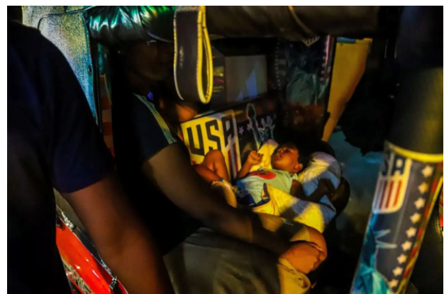
Photograph 06: Desperate times, desperate life. Tuk-tuk driver, his wife and two-year-old daughter curl up to sleep in the tuk-tuk, which is parked in a petrol queue overnight. (Gamage, Petrol queue in Kelaniya 2022).