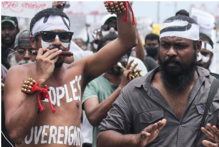
Photograph 21: "Bakeriya Kattiya" music group during the protest March at Galle Face (Gamage, Bekariya Kattiya 2022)

according to the situation and time and is related to the economic and political crisis. I wanted to take my art beyond the galleries and open doors for everyone. Gallery based art or even the resistance arts displayed in galleries are limited only to a certain class, and I wanted to go beyond that limitation. Through the Aragalaya art gallery, I tried to teach children and others about art and capture their expressions and memories of this very political moment in our history. Even my early art works were for the people but I thought that this political moment is crucial and could turn things towards the people's way further" (Rathnayaka 2022).