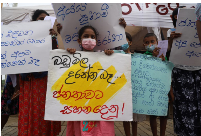
Photograph 09: Protest at Gotagogama, Galle (Gamage, GGG Galle 2022).

Among the most highlighted features of the Aragalaya – the people’s struggle – were the uses of social media (New Media) as well as various forms of art to engage with people. Social media played a major role in creating and expanding an informal social contract among the people of Sri Lanka, urging them to resist the government. Different forms of Arts including painting, music, drama theatre, cinema, visual arts and photography, poetry and literature were also used and they played a more active role in expressing the resistance and mobilization of people through alternative artistic expressions.