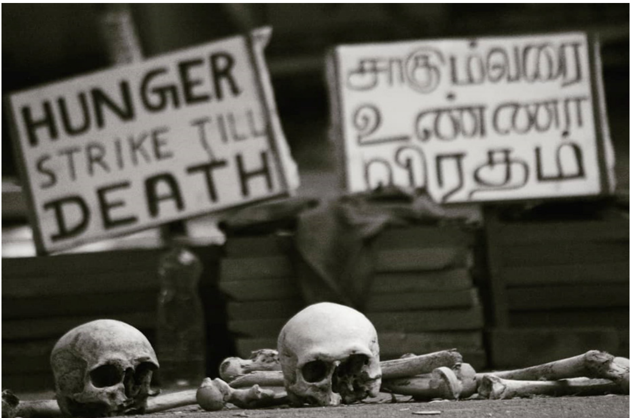
Photograph 13: The Jantra Mantra, India. Farmers protest using the skulls of farmers who committed suicide, unable to cope with their financial burdens caused by government policies and climate change

Protest art emerged to express opposition to the Yugoslavian wars and during the Arab Spring in Egypt and the other countries in the Middle East as well. More recently and closer to Sri Lanka, the protests in India against the amendment to the Citizenship Act, and the farmers' struggle, galvanised protests. So did the death of 22-year-old Iranian student, Mahsa Amini in police custody after she was arrested for allegedly wearing her headscarf too loosely have led to anti-governmental protests in Iran since 2022. All these events have been captured and widely disseminated through the use of art. Thus, the strength of art as a powerful tool of protest in various forms is well established.