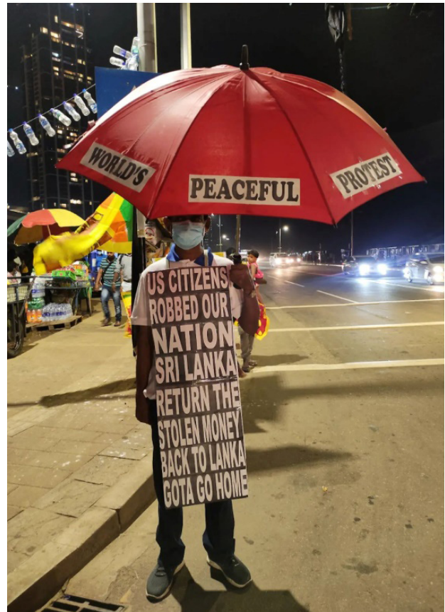
Photograph 11: The Creative Protester (Gamage, The Creative Protester 2022)

became the “common sense” values of everyone in the State, particularly those subordinated by it. People in the working class (and other classes) identified their good with the good of the bourgeoisie and helped to maintain the status quo rather than revolting. In the context (or expression) of cultural hegemony, there is a clear relationship between persuasion, consent and the occasional use of brute force. (Gramsci 1971). Art constructs a popular culture which is affiliated to the ruling elite and expands its ideological power base. Challenging that orthodoxy, thorough the alternative discourses that are relevant to that time and space is crucial expressions to expand the true realities facing the polity among the larger community.